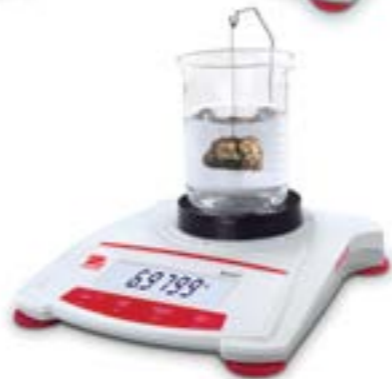
Scout shown with optional Density Determination Kit